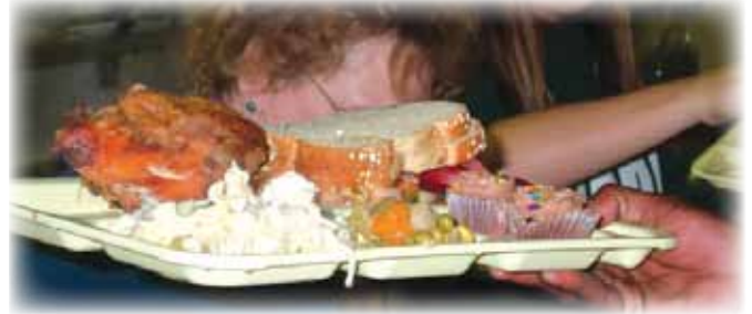
A hearty meal is served at the soup kitchen.

Over the past month, the Community Kitchen has served an average of 232 hot meals each weekday evening. The numbers are actually down a bit due to the cold weather when many homeless try to find shelters in the early afternoon. A good meal can satisfy the hunger for food, the hunger for company and the hunger for hope in a harsh world.