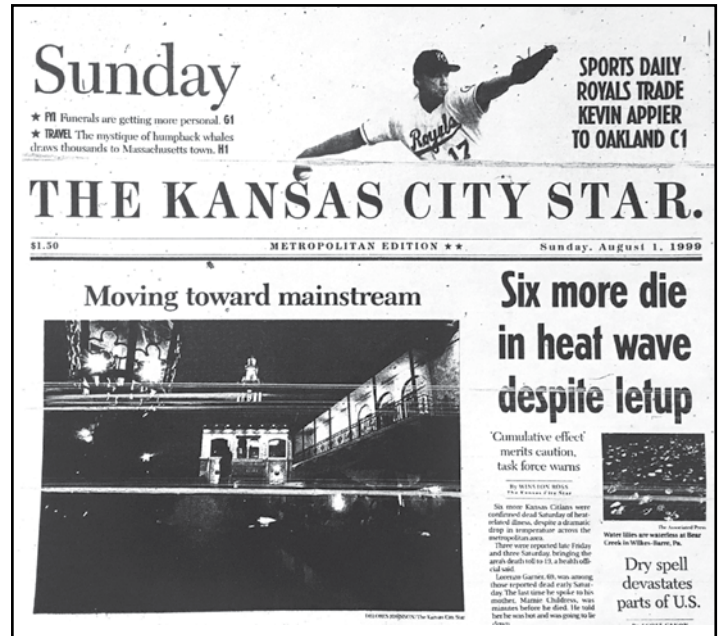
Front page of The Kansas City Star from August 1, 1999, reporting heat-related deaths.

“Thank you very much for the Air Conditioner. Without it, I am not able to breathe very well. It helps me tremendously- I really do appreciate it.”