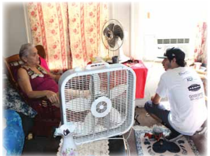
Before receiving an air conditioner through Project ElderCool, this woman used two fans in an attempt to beat the heat.