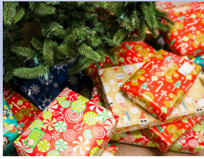
Local H&R Block employees collected and wrapped Christmas gifts of children's clothing and bedding to help fill the clothing closet for community members in need.

From food, to coats, to hot boxes and bedding, the 2021 holiday season was jam-packed with generosity from the local community. Check out a few highlights below, and connect with us on social media for details!