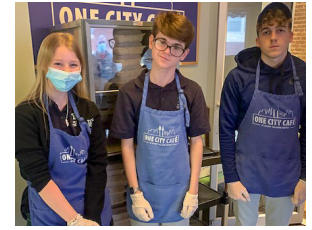
Grant support from Cerner Charitable Foundation allowed us to purchase a new hot box for One City Café, providing healthy meals for even more hungry community members.