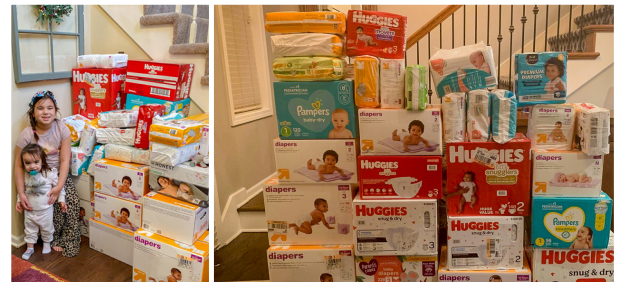
Diapers collected in KindCraft's January diaper drive. Bottom left: Rick's grandchildren with donations.