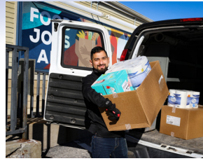
Sioux Chief Manufacturing donated a van to help the food pantry team at our Truman location pick up food and in-kind donations, make deliveries to seniors in need, and more.