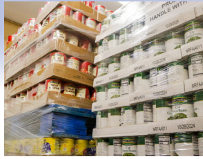
Cosentino's Food Stores delivered a semi-truck filled with more than 40,000 pounds of non-perishable food to help stock the food pantries.