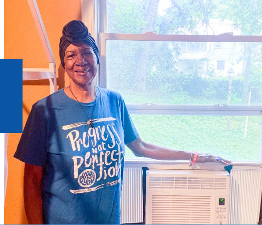
One of this year's recipients with her AC unit, grateful for a cool home as she cares for her granddaughters after her daughter's passing. "We appreciate all you do," she said in a thank you note.